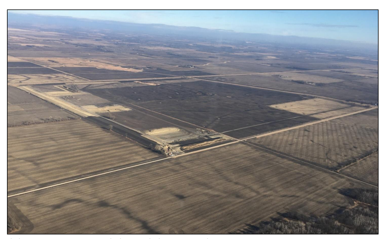
Black River Dam construction in Red Lake Watershed District, November 2020

The Authority is currently made up of seven watershed districts in Minnesota and fourteen water resource districts in North Dakota. See site location map on page 3 for the "Authority Area".