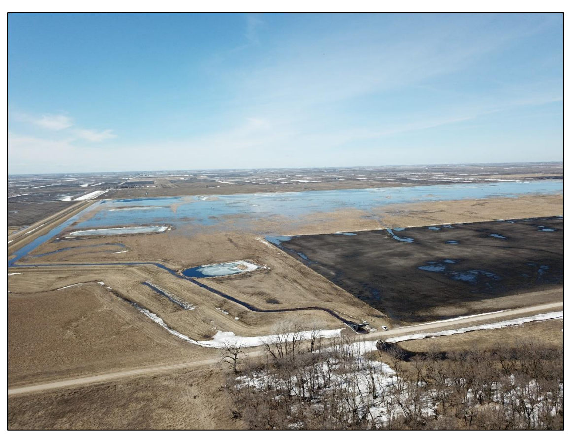
Brandt-Angus Impoundment inlet in the Middle-Snake-Tamarac Rivers Watershed District