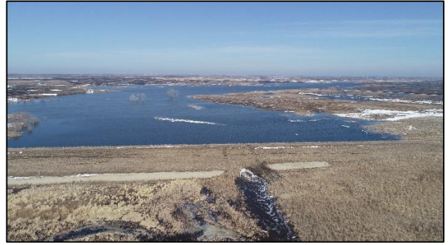
Upper Maple River Dam – Maple - Steele County Joint WRD