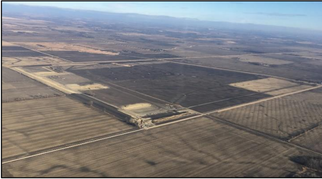
Black River Dam – Red Lake Watershed District

Supplemental Services: The Authority reserves the right to retain the services of other consultants as needed for specific Basin retention issues. While infrequent, the use of outside consultants may be used in special circumstances.